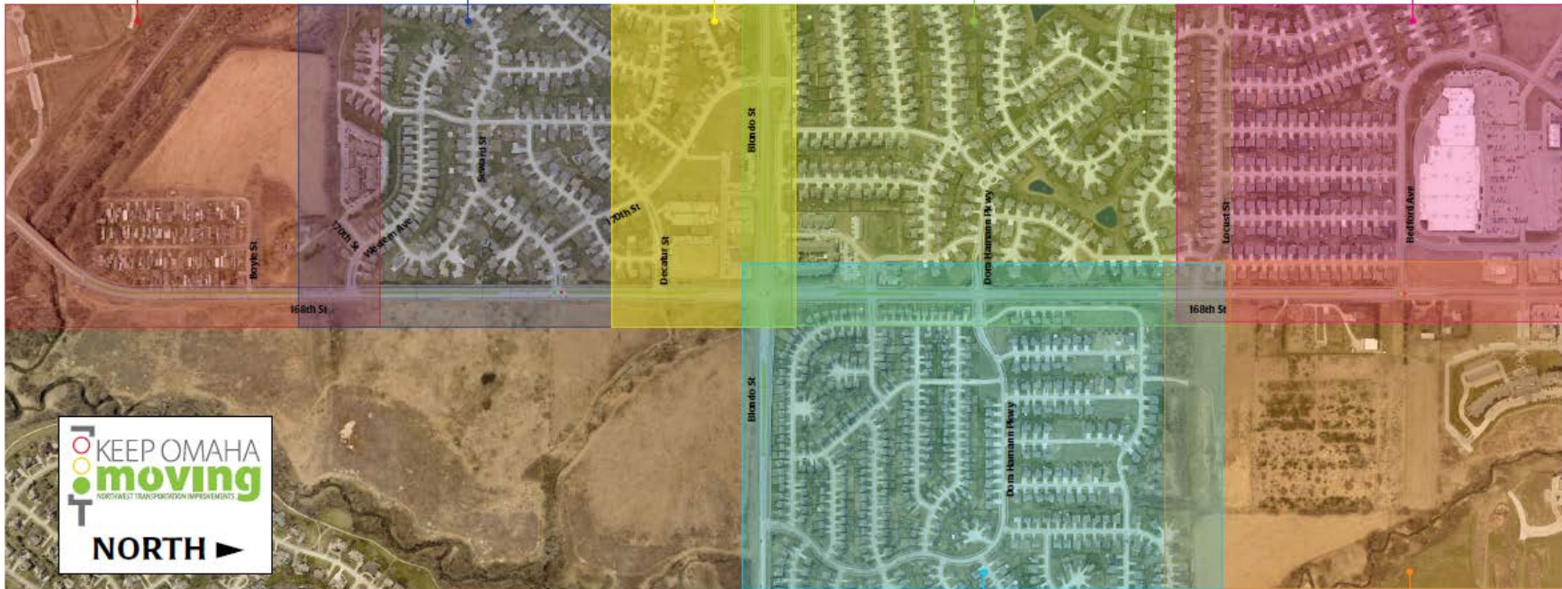
Station 7: Carriage Hill & Shadow Glen